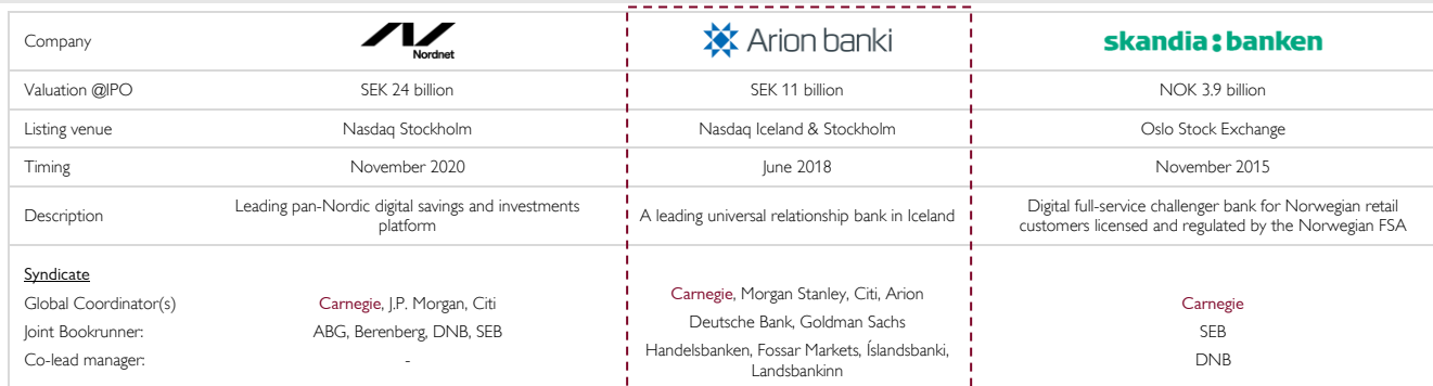
EXHIBIT III: CARNEGIE IS THE GO-TO INVESTMENT BANK FOR NORDIC BANK IPOs

In addition to the above, Carnegie has also advised on a large number of ECM and M&A transactions within the FIG sector. As an example, Carnegie has recently made placements in Arion Banki, Resurs Bank, Jyske Bank and Hoist Finance as well as sold Svedea Insurance, Skandia in Denmark and assets of Insr. Based on the additional complexity and knowledge as well as experience required in connection with an IPO of a bank, we recommend having an experienced local investment bank in place early on in the IPO process to lead and give guidance on structuring and preparations.