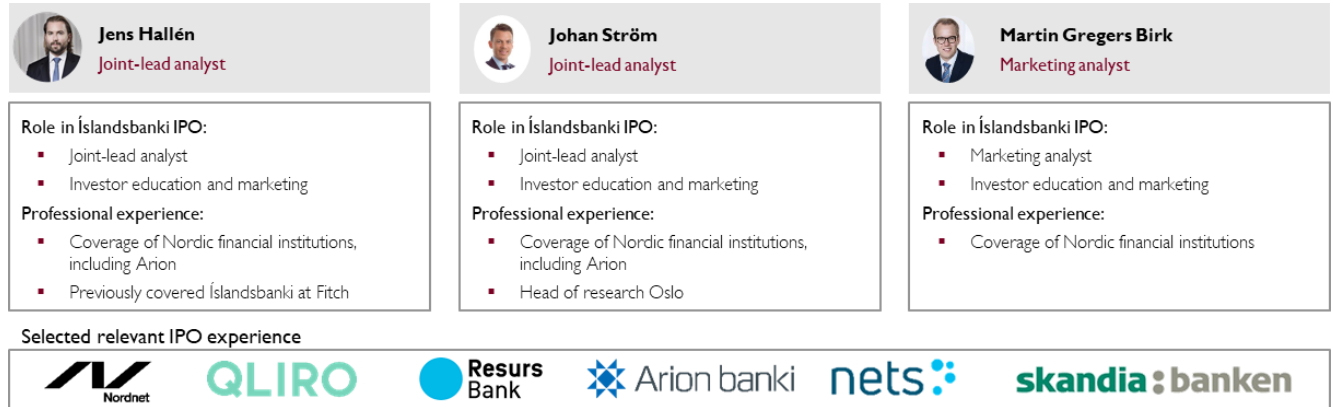
EXHIBIT IV – THE PROPOSED CARNEGIE EQUITY RESEARCH TEAM FOR THE ÍSLANDBANKI IPO