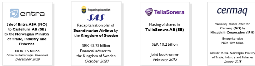
EXHIBIT V – EXTENSIVE RECENT EXPERIENCE IN ADVISING NORDIC GOVERNMENTS

In December 2020, Carnegie acted as financial adviser to the Norwegian Government, acting through the Norwegian Ministry of Trade, Industry and Fisheries, in connection with the sale of their 8.2% stake in Entra to Castellum for an amount of NOK 2.5 billion. The transaction was part of a public takeover attempt by both Castellum and SBB, and Carnegie advised the Norwegian Government on its role as a key shareholder in Entra.