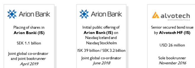
EXHIBIT VI – HIGHLY RELEVANT EXPERIENCE WITH ICELANDIC COMPANIES

On the transaction side, Carnegie helped Alvotech issue a USD 26m bond in 2016.